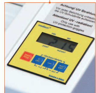
Microcontroller with LC-display